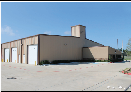
Phase 2 units are 22' x 50', Fully customizable