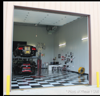
Own the ultimate garage space