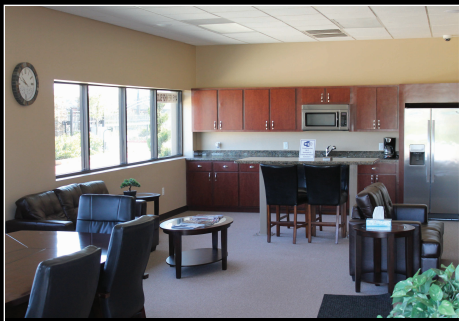
Clubhouse available to all owners