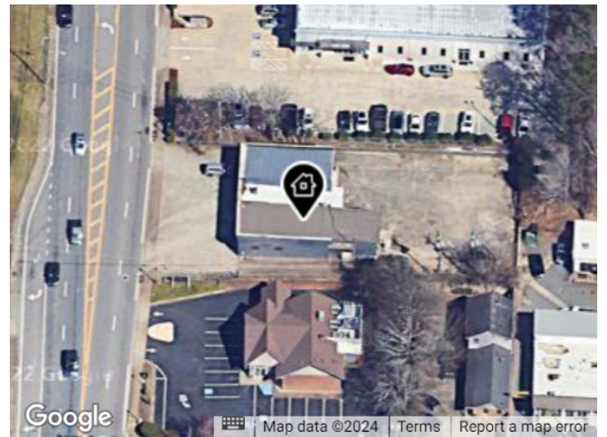
Legend: Subject Property