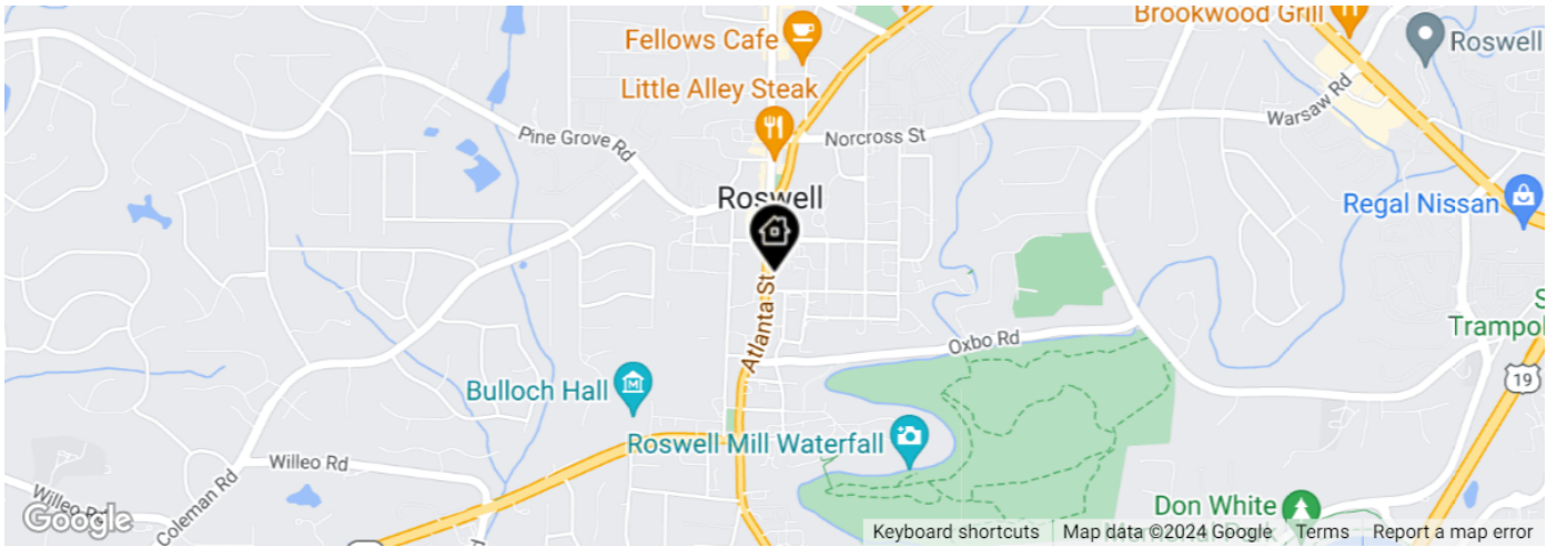
Legend: Subject Property