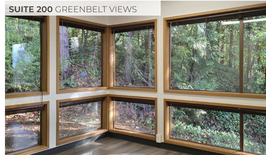
SUITE 200 GREENBELT VIEWS