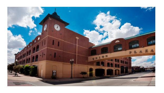
Parking available at UnionPlaza Parking Garage, entrance over San Antonio St.