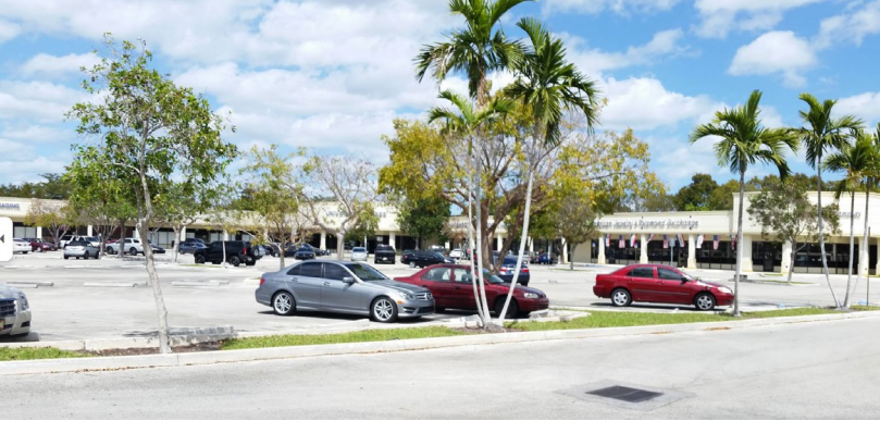
Nearby shopping centers offer great convenience