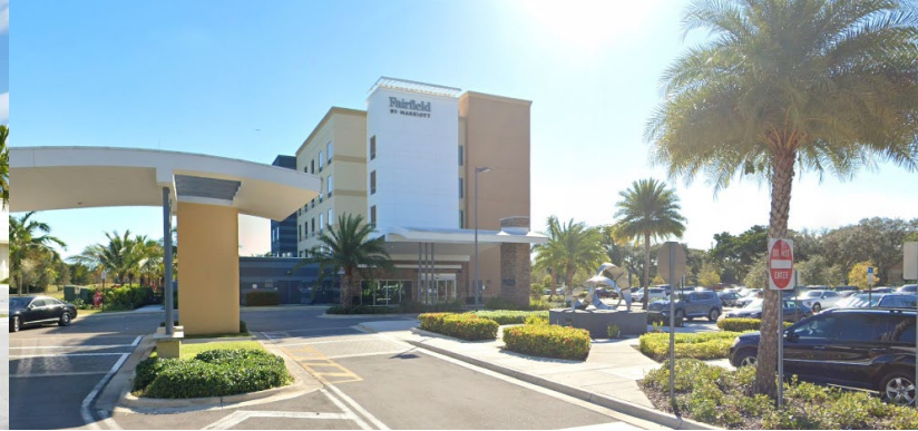
Lodging adjacent to the property