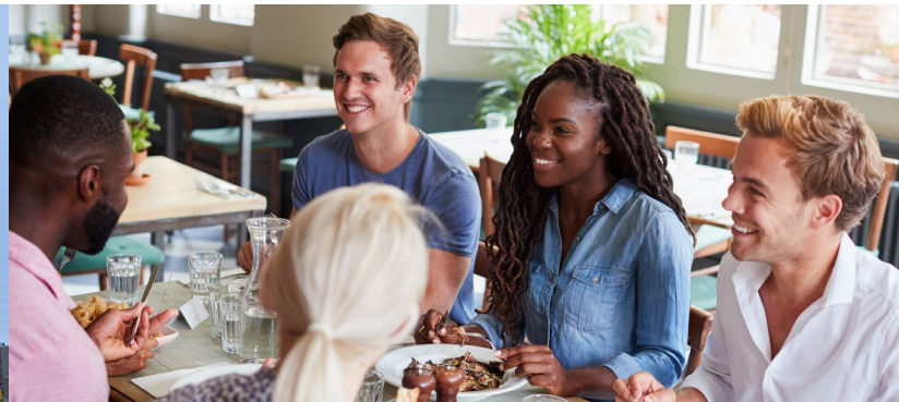
Numerous dining options nearby