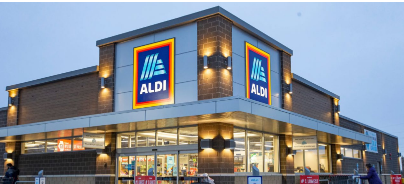
Aldi Supermarket 0.4 mile down the street