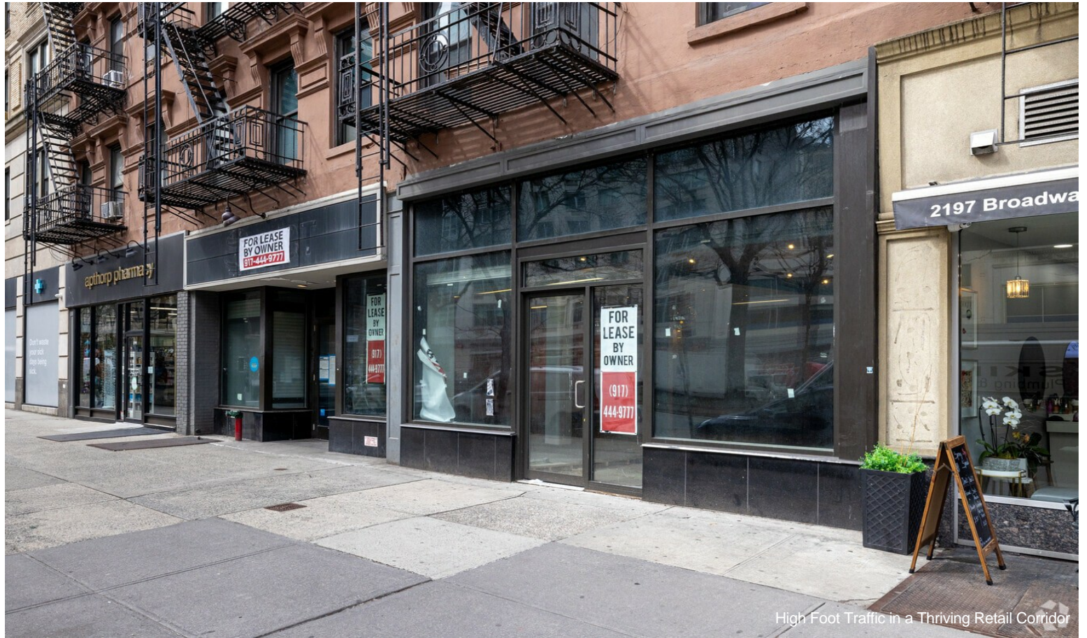
High Foot Traffic in a Thriving Retail Corridor