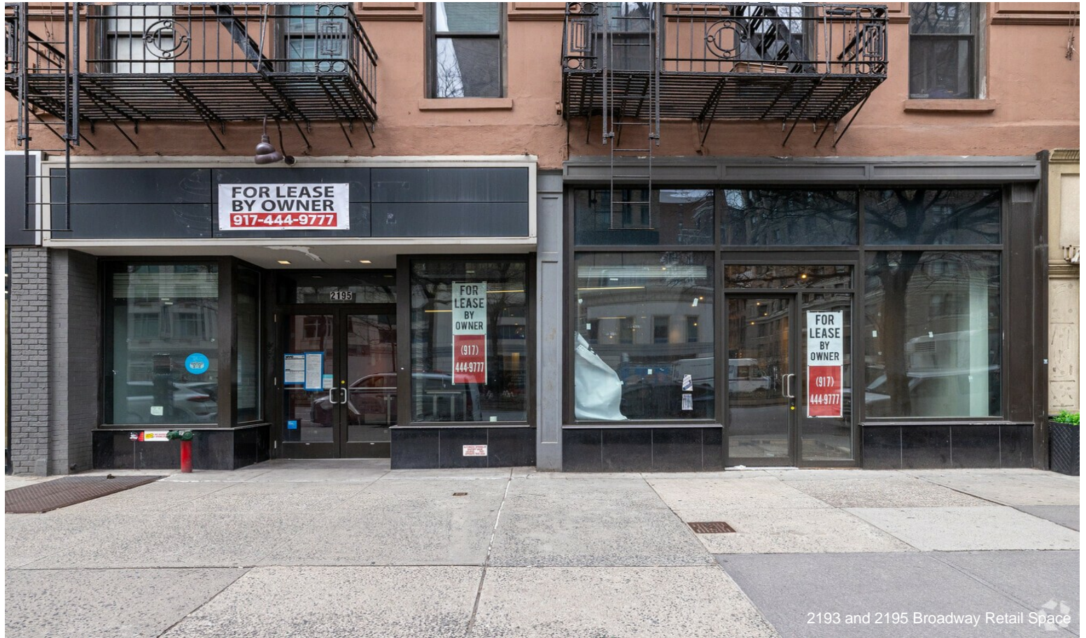
2193 and 2195 Broadway Retail Space