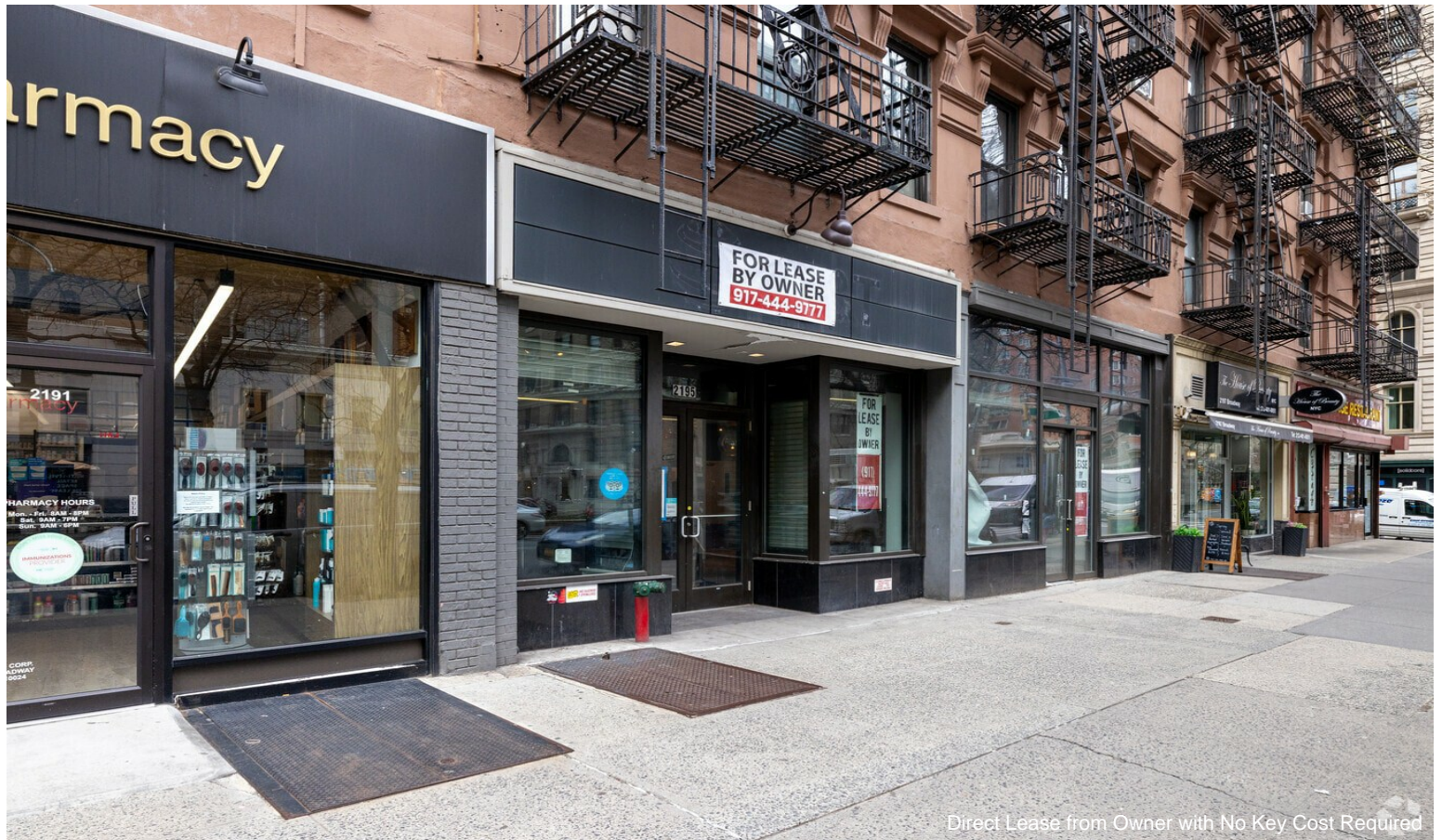
Direct Lease from Owner with No Key Cost Required