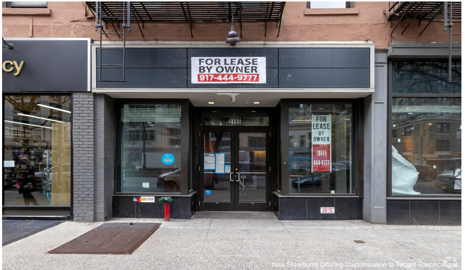
New Storefronts Offering Customization to Tenant Specifications