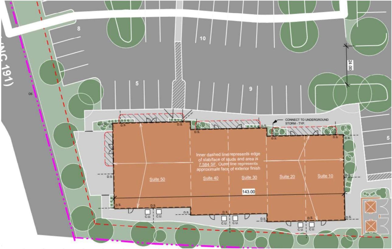
EXHIBIT 300 - BUILDING 3, SITE & LEASING PLAN 1874 Brevard Rd, Arden, NC 28704