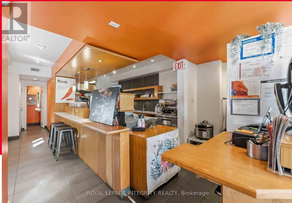
ROYAL LEPAGE INTEGRITY REALTY, Brokerage