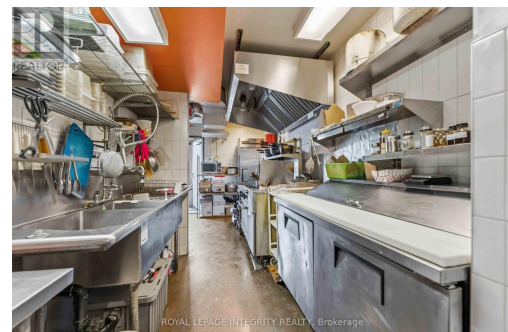
ROYAL LEPAGE INTEGRITY REALTY, Brokerage