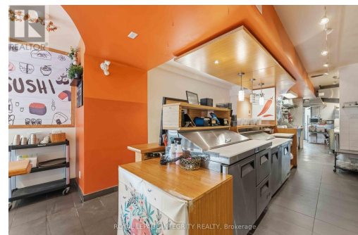
ROYAL LEPAGE INTEGRITY REALTY, Brokerage