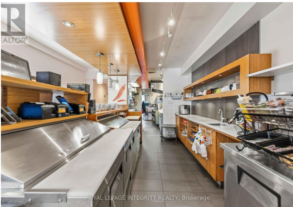
ROYAL LEPAGE INTEGRITY REALTY, Brokerage