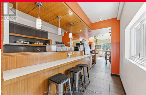
ROYAL LEPAGE INTEGRITY REALTY, Brokerage