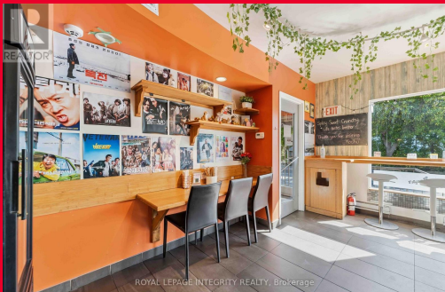
ROYAL LEPAGE INTEGRITY REALTY, Brokerage