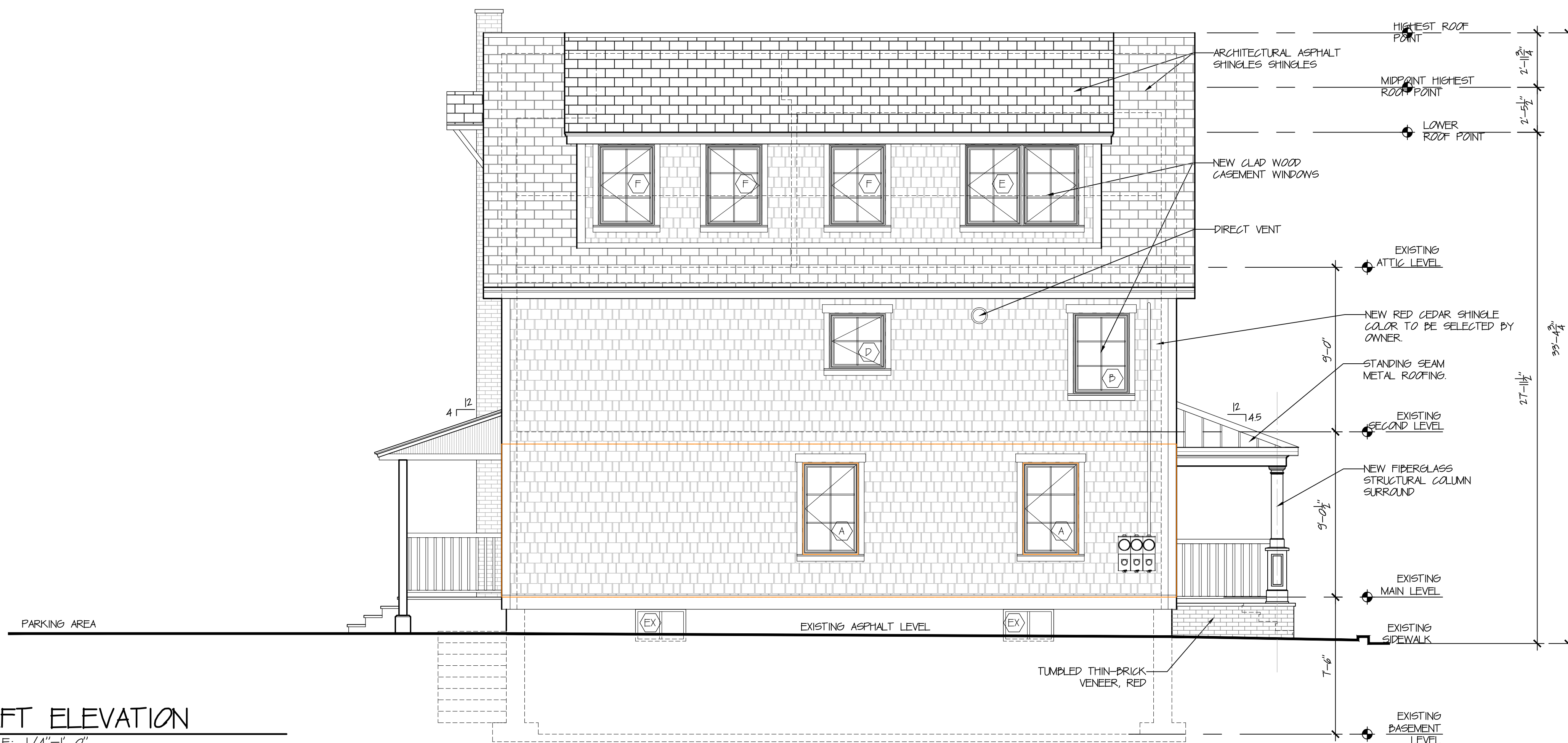
2 LEFT ELEVATION SCALE: 1/4"=1'-0"

THIS DOCUMENT, AND THE IDEAS AND DESIGNS INCORPORATED HEREIN, AS AN INSTRUMENT OF PROFESSIONAL SERVICE, IS THE PROPERTY OF P H ARCHITECTS L.L.C. AND IS NOT TO BE USED, IN WHOLE OR IN PART, FOR ANY OTHER PROJECT WITHOUT THE WRITTEN AUTHORIZATION OF P H ARCHITECTS L.L.C. WORK SHALL CONFORM TO APPLICABLE CODES AND REQUIREMENTS OF UTILITIES AND AUTHORITIES HAVING JURISDICTION. DO NOT SCALE THE DRAWINGS. VERIFY ALL DIMENSIONS IN THE FIELD. REPORT DISCREPANCIES.