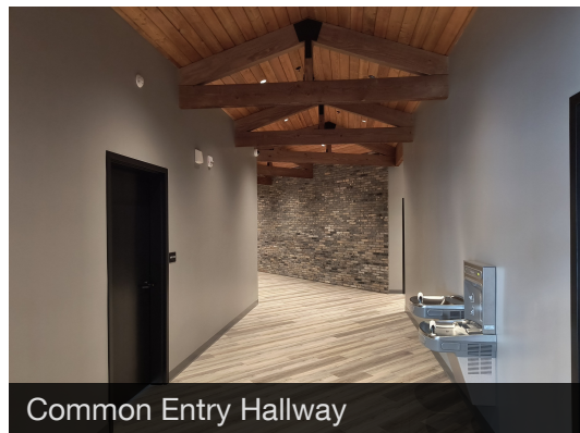
Common Entry Hallway