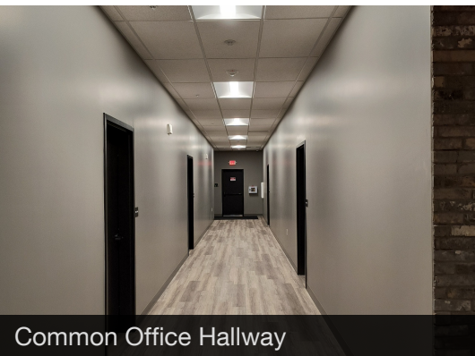
Common Office Hallway