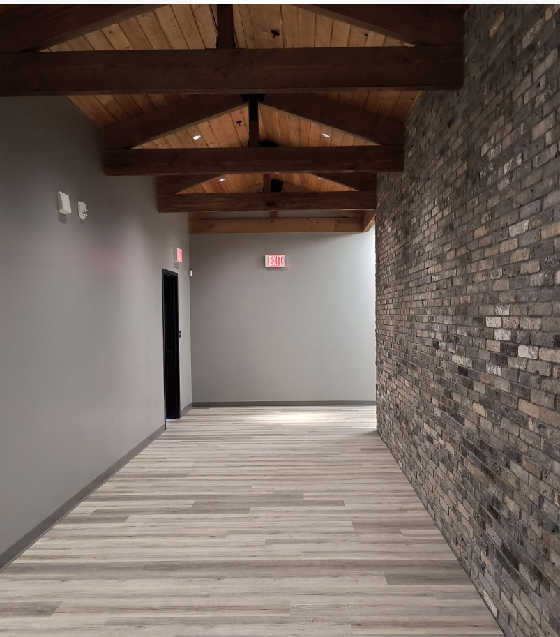
Common Retail Hallway