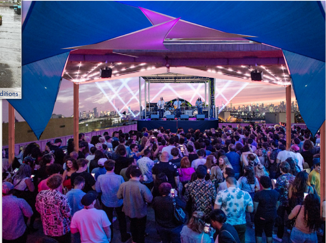
Rendering for concept only

5 Minute walk to the L-train at Montrose Avenue Station