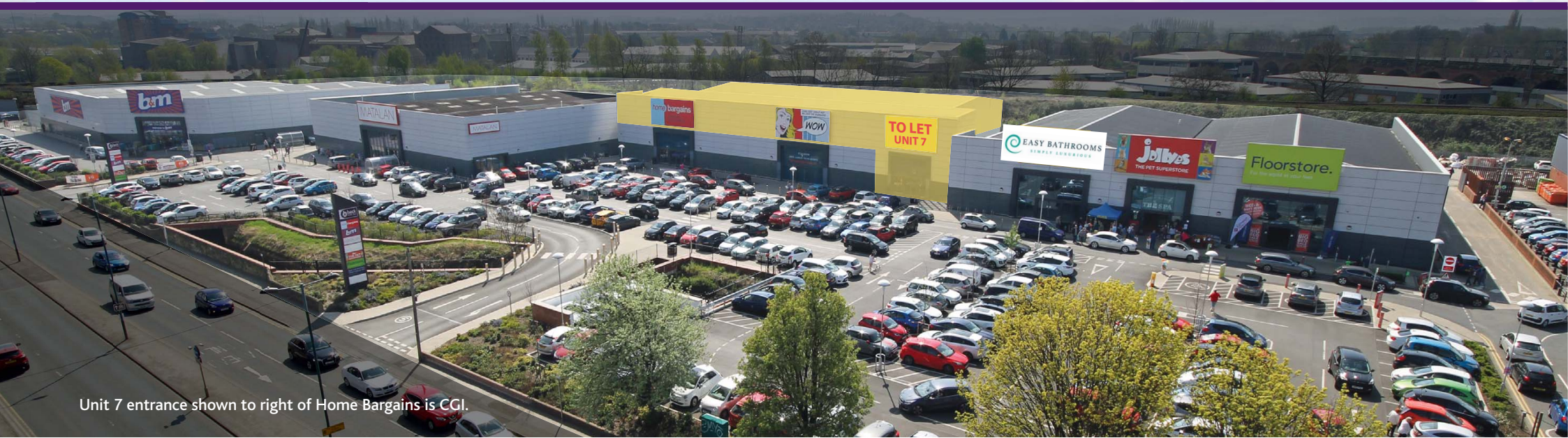
Unit 7 entrance shown to right of Home Bargains is CGI.