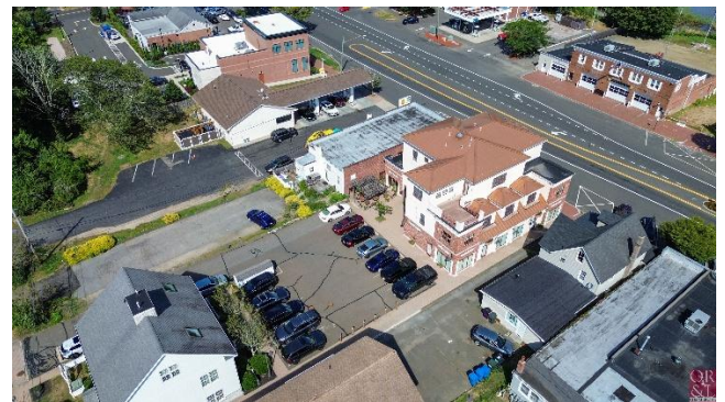
Rear Employee Parking: