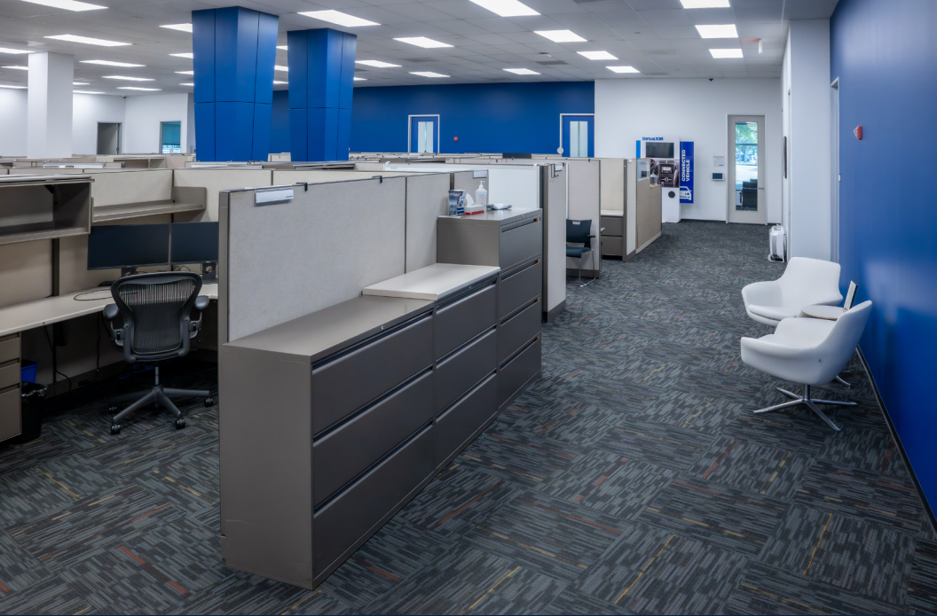
Freeport Business Center III - 58,380 SF Available