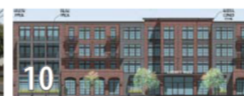
10 MV2 Mill One Mixed Use Office + Commercial + Residential To activate this end of Moore Avenue and better connect the Downtown Core with Liberty Park