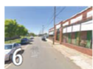
6 Opportunity: Broad Street