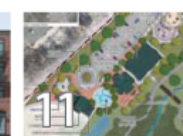
11 Liberty Park Phase 1 improvements are complete. Phase 2 is in progress.