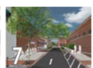
7 Moore Avenue Streetscape Sidewalk, street trees, landscape, & smart lights