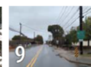
9 Opportunity: Church Street Additional opportunities for improvement sought as redevelopment occurs