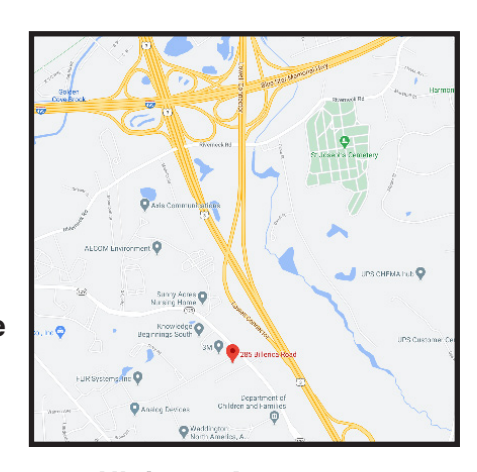
Highway Access: 0.5 miles to US Rte 3 2.5 miles to I-495