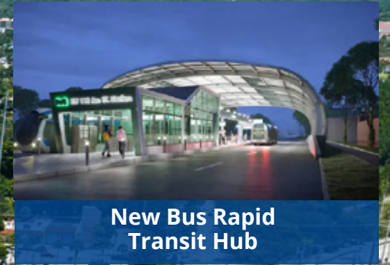
New Bus Rapid Transit Hub