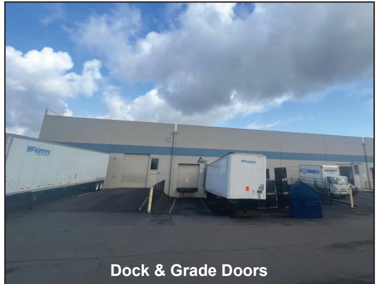
Dock & Grade Doors