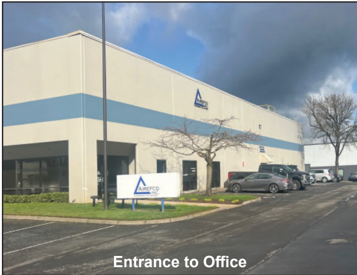
Entrance to Office