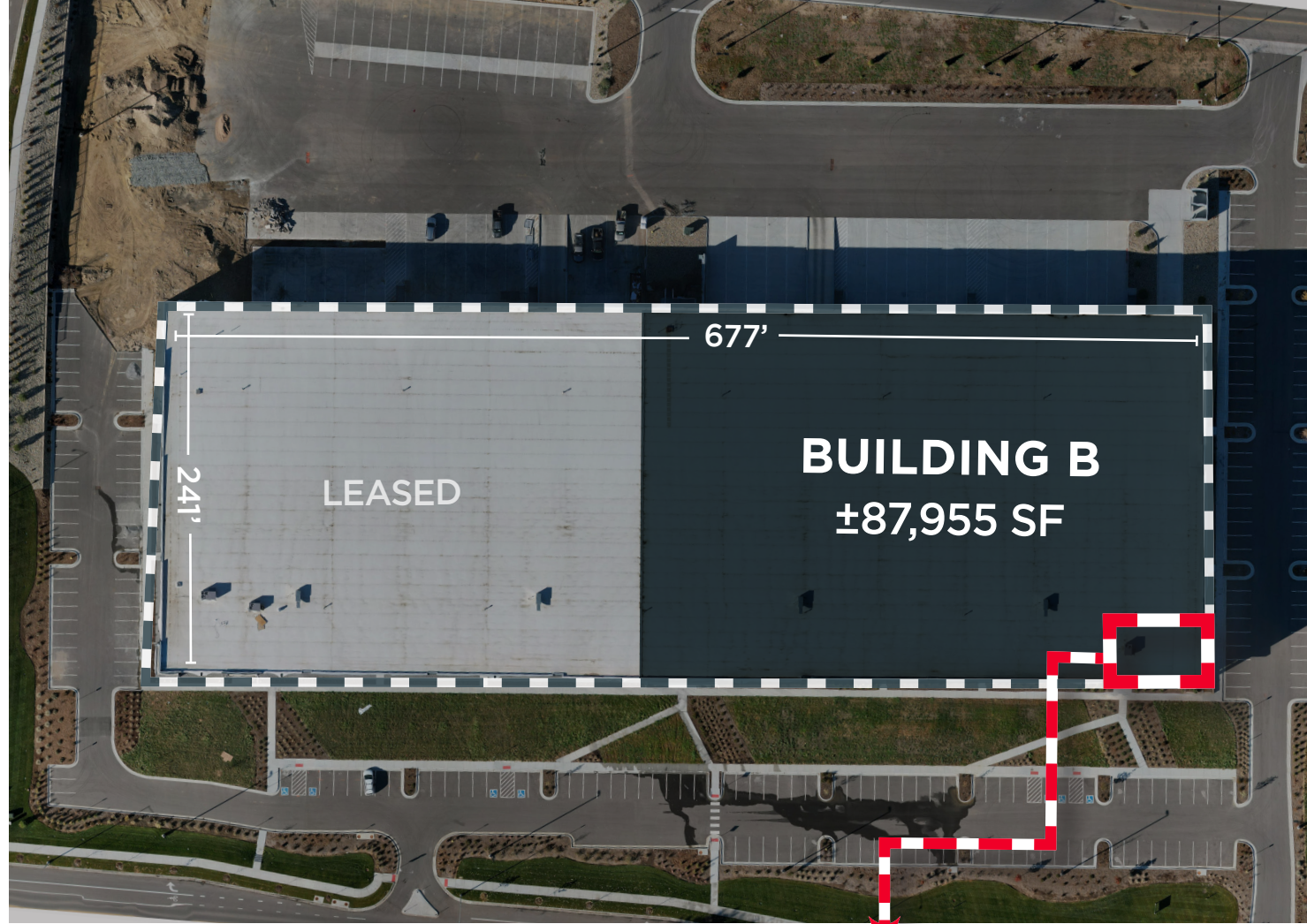
Building B Spec Office | 3,083 SF