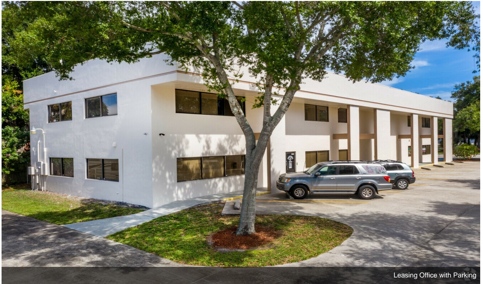
Leasing Office with Parking