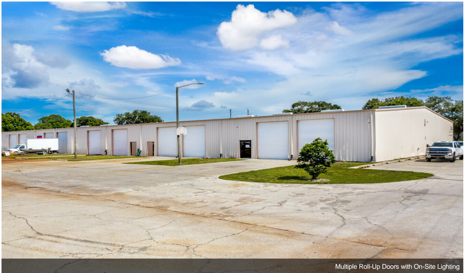
Multiple Roll-Up Doors with On-Site Lighting