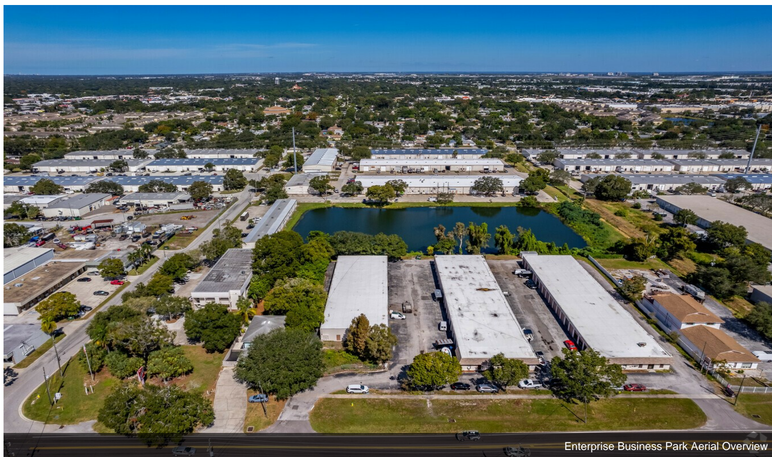
Enterprise Business Park Aerial Overview