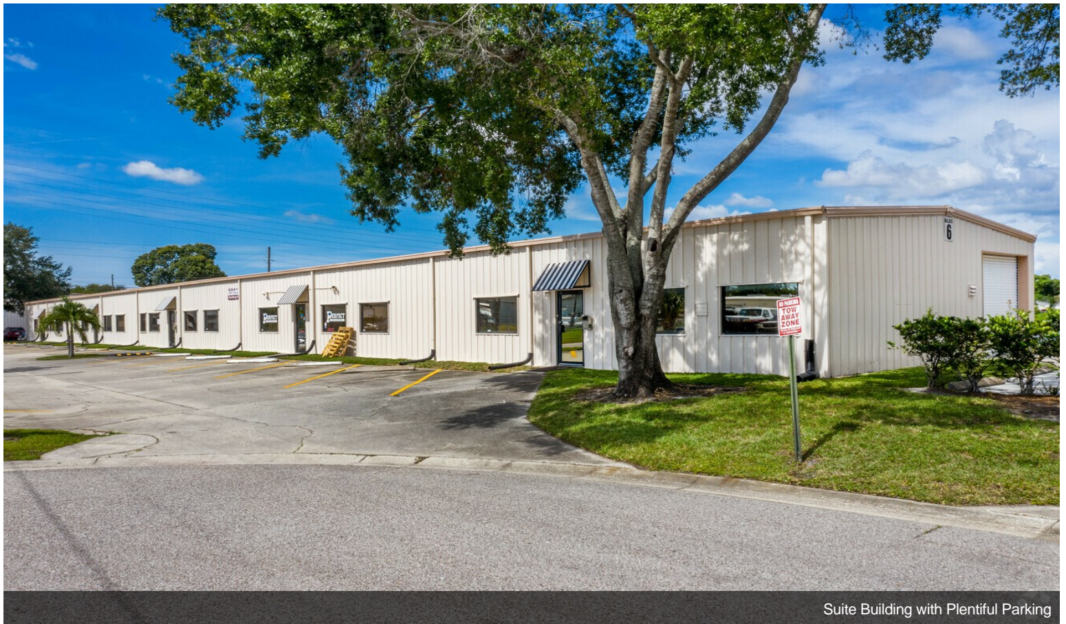
Suite Building with Plentiful Parking