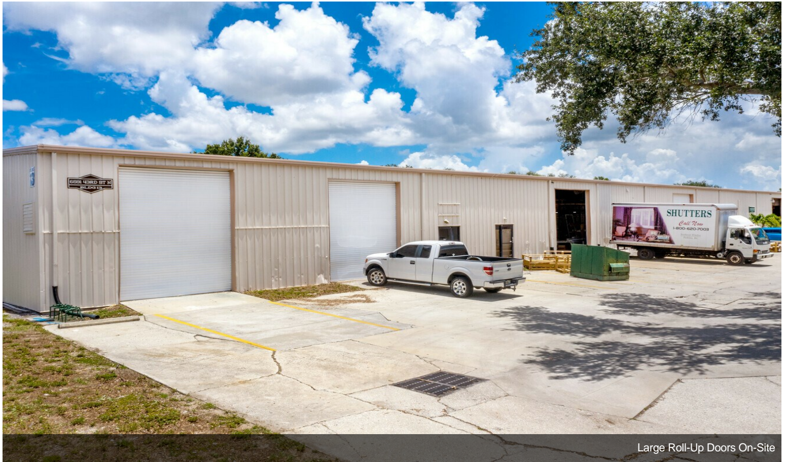
Large Roll-Up Doors On-Site