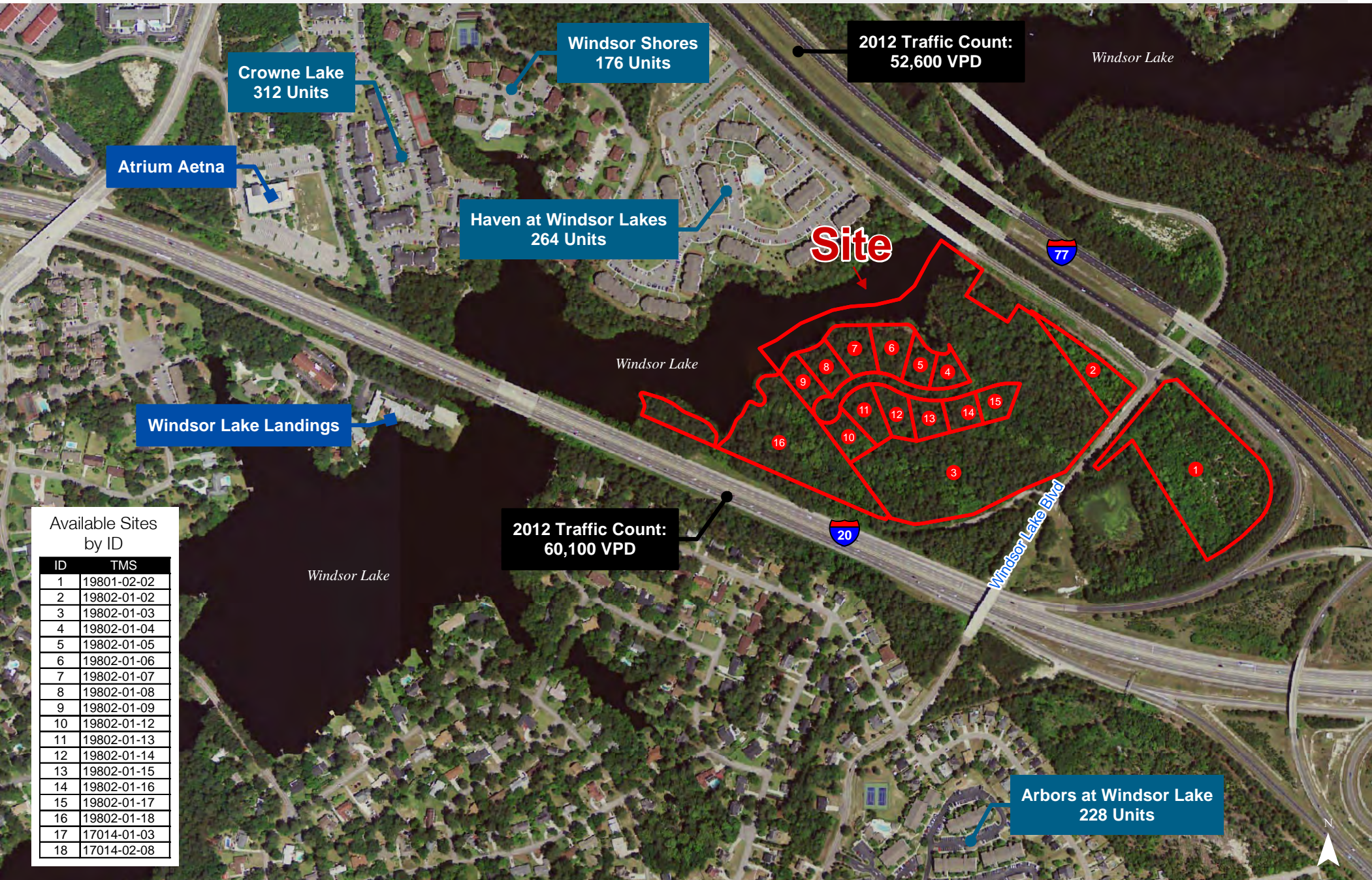
Available Sites by ID