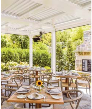
Information is from sources deemed reliable, but no warranty or representation is made to the accuracy thereof. Information is submitted subject to errors, omissions, prior sale, or lease withdrawal without notice.