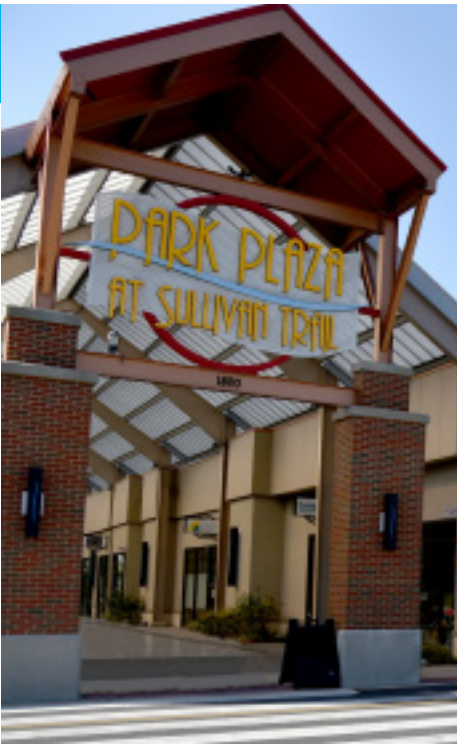
Plaza East Entrance