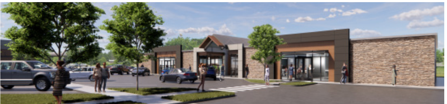
Mockup of Expansion Building C

Park Plaza continues to be a cornerstone for economic and community development in Forks Township, meeting local demands for restaurants, entertainment, and recreation while fostering a sense of place and connection for all residents.