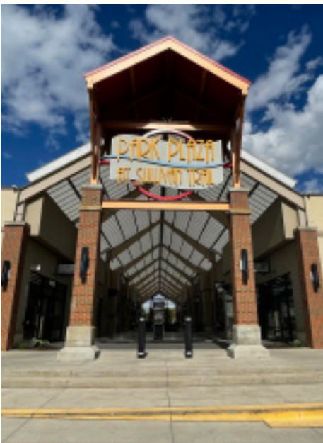
Plaza West Entrance

Park Plaza is a strategically located commercial and retail center in the heart of Forks Township, connected to Forks Township Community Park. Offering a mix of shopping, dining, and recreational opportunities, it serves as a vibrant alternative to the Lehigh Valley Mall and Promenade Shoppes. With 100,000 SF of leasable space, 80% of which is occupied, the Plaza enhances community life with flexible green spaces, fire pits, outdoor seating, and event programming.