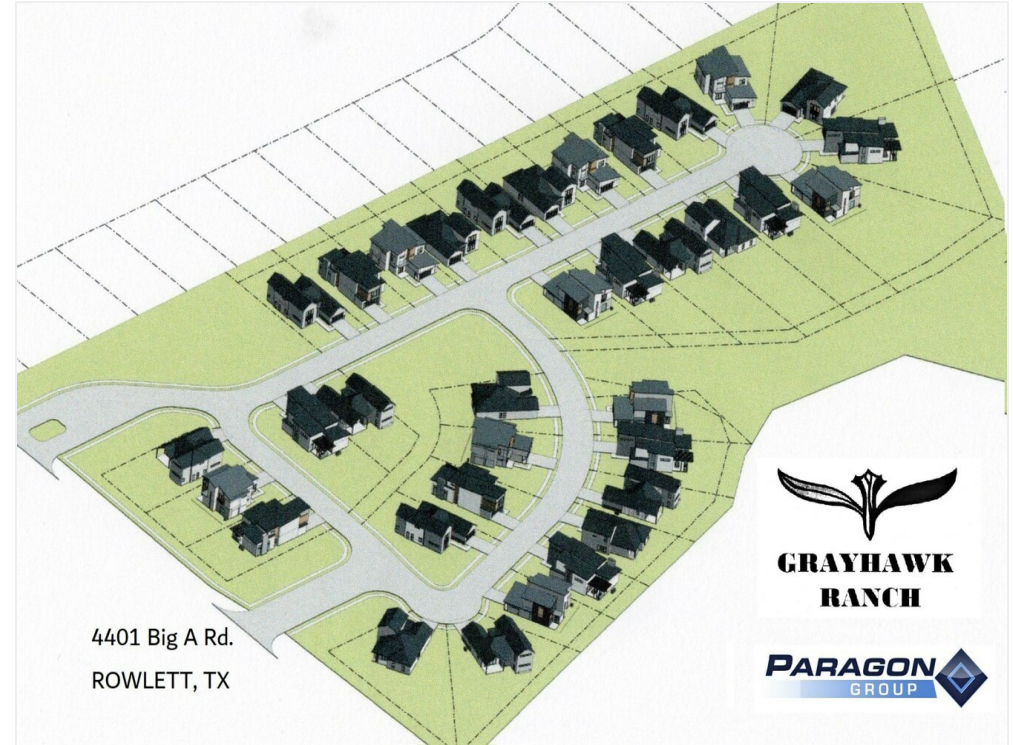
3D-4401 Big A