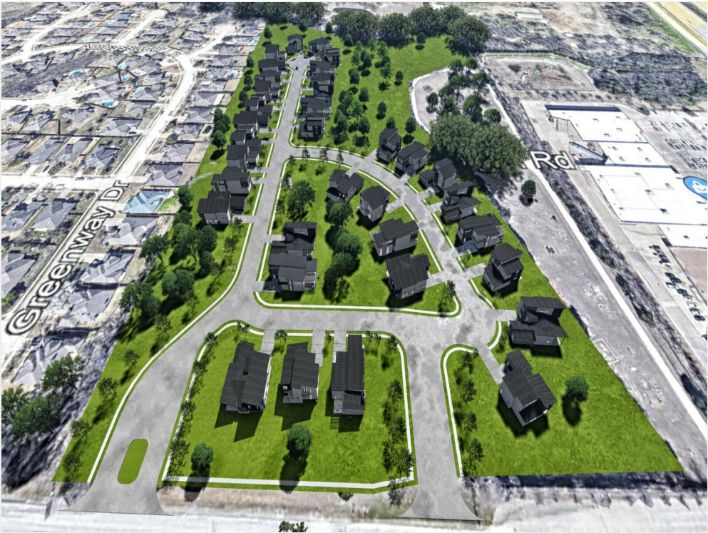
GREYHAWK_Photo - 6 (1)