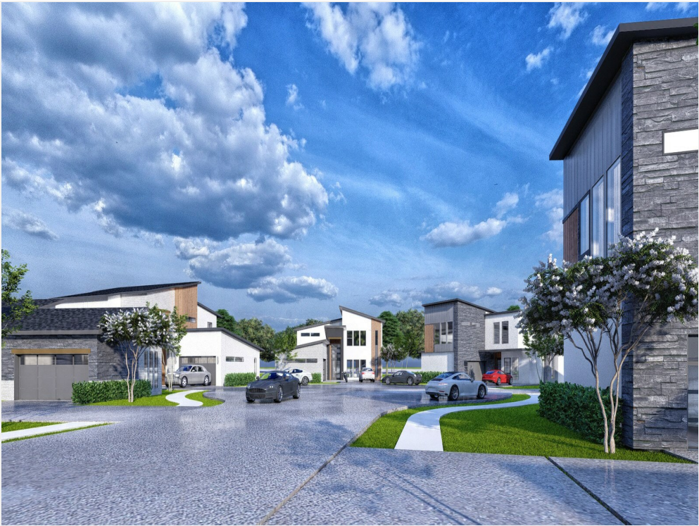
GREYHAWK_Photo - 5