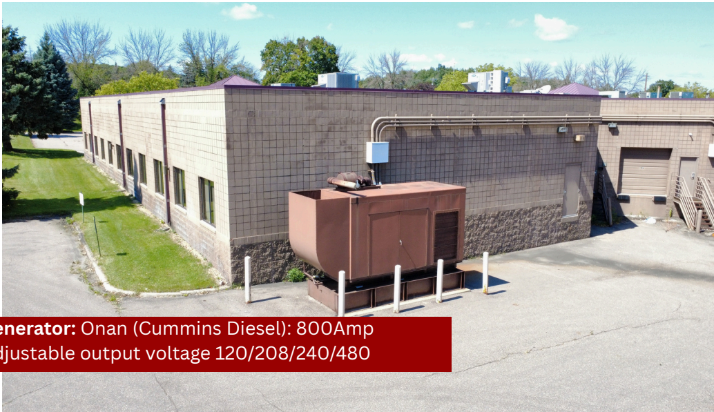
Generator: Onan (Cummins Diesel): 800Amp adjustable output voltage 120/208/240/480