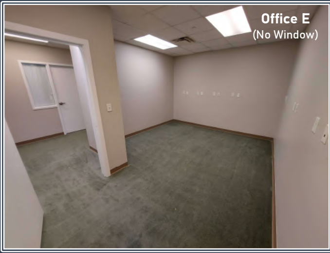
Office E (No Window)