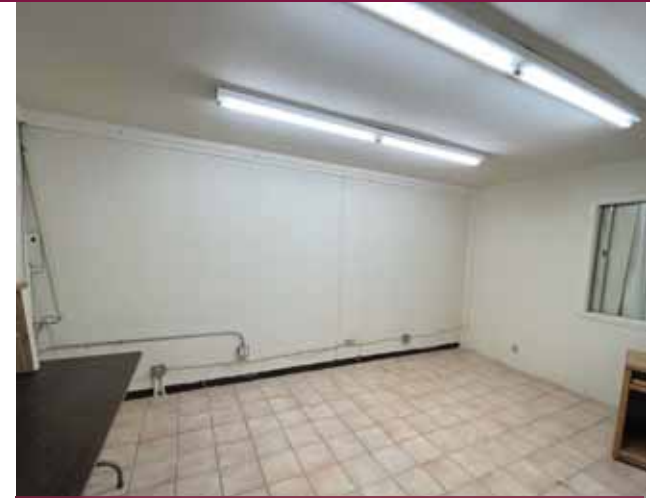
552 S. Murphy Avenue - Interior