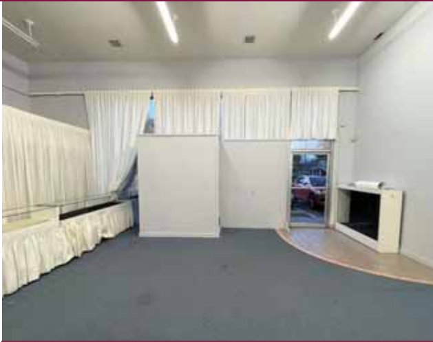
552 S. Murphy Avenue - Interior