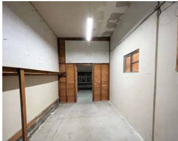
552 S. Murphy Avenue - Interior