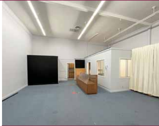
552 S. Murphy Avenue - Interior