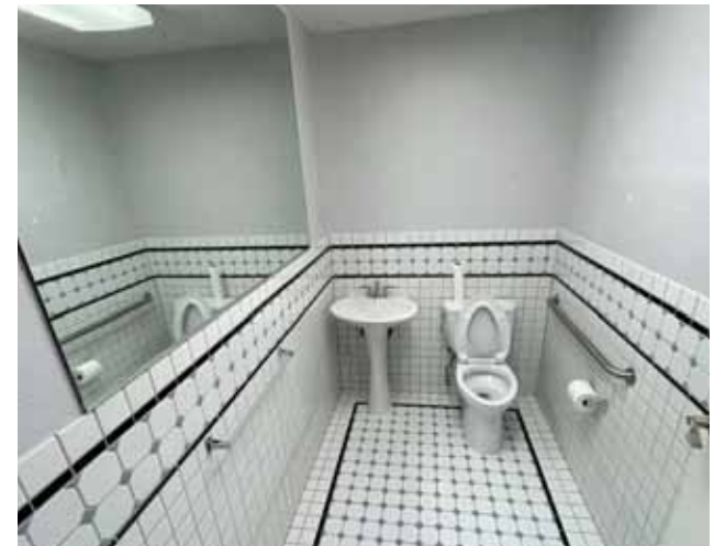
552 S. Murphy Avenue - Interior