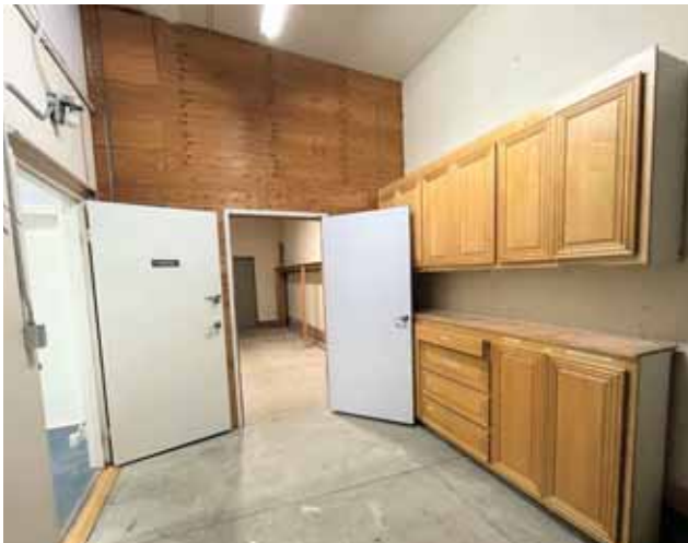
552 S. Murphy Avenue - Interior