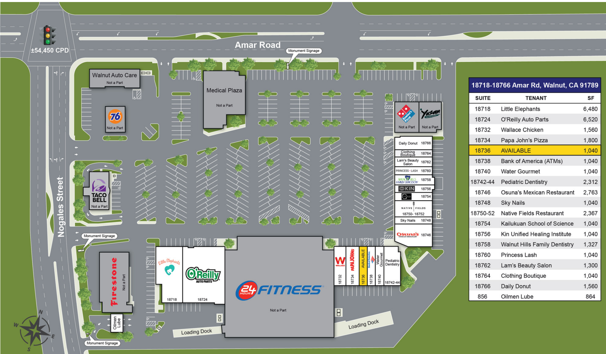
18718-18766 Amar Rd, Walnut, CA 91789