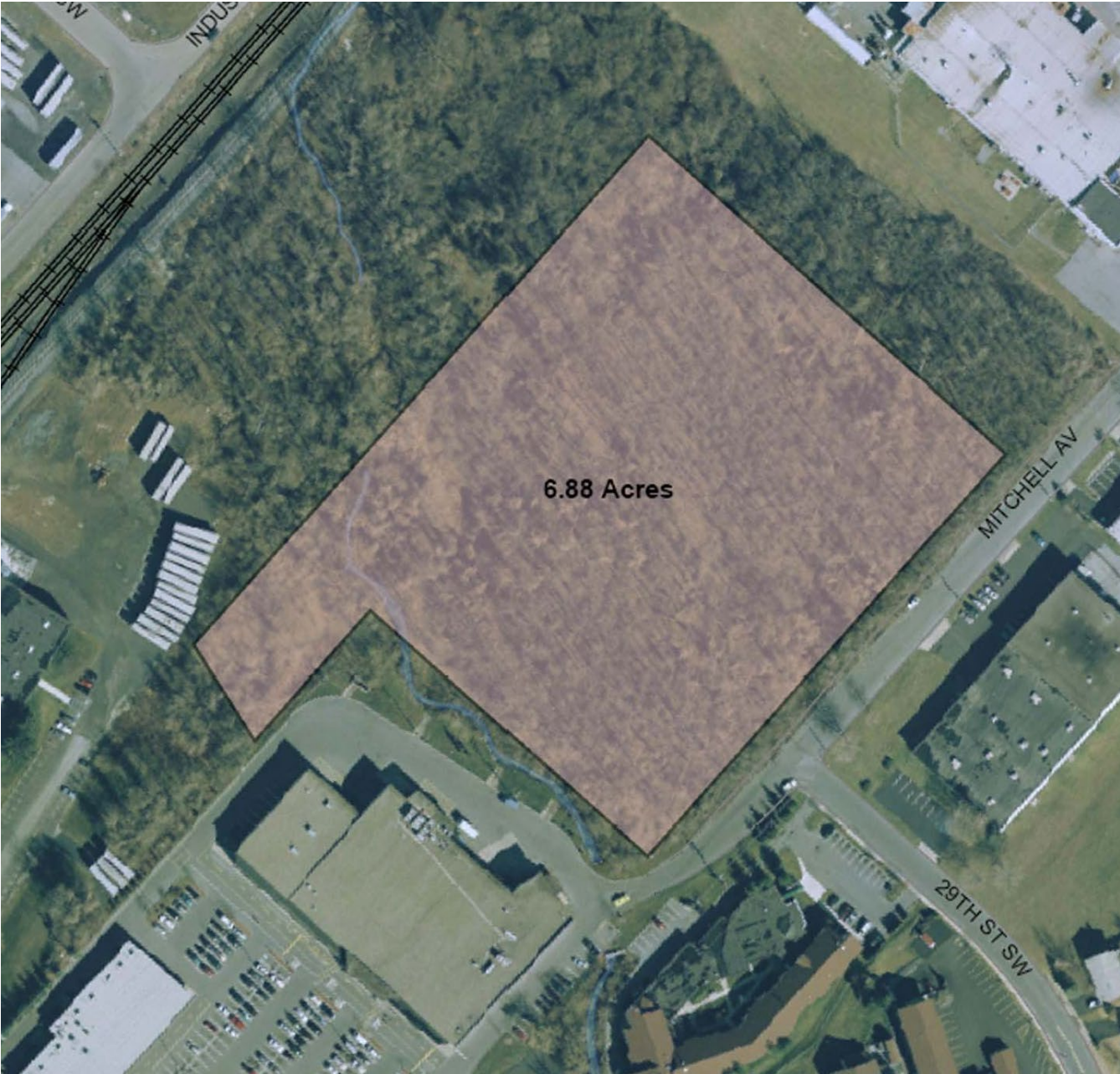
Aerial of parcel