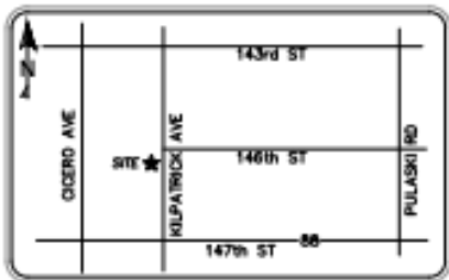
Vicinity Map n.l.s.