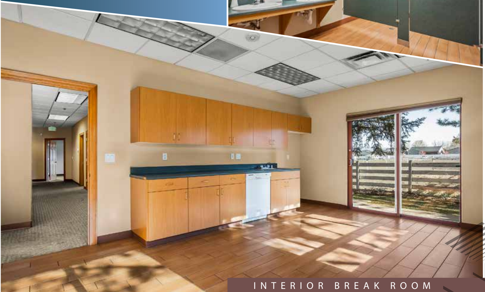
INTERIOR BREAK ROOM