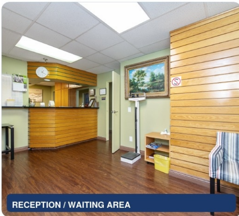
RECEPTION / WAITING AREA