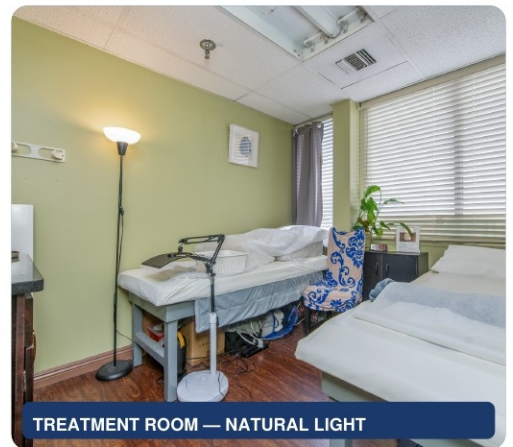
TREATMENT ROOM — NATURAL LIGHT