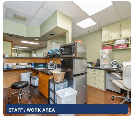
STAFF / WORK AREA