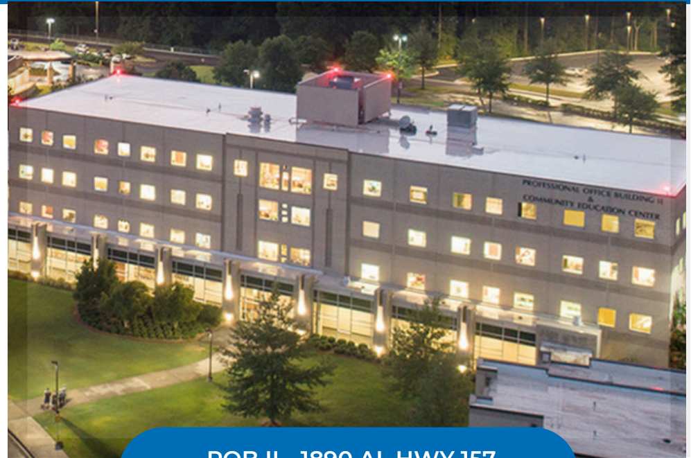
POB II - 1890 AL HWY 157 74,500 RSF