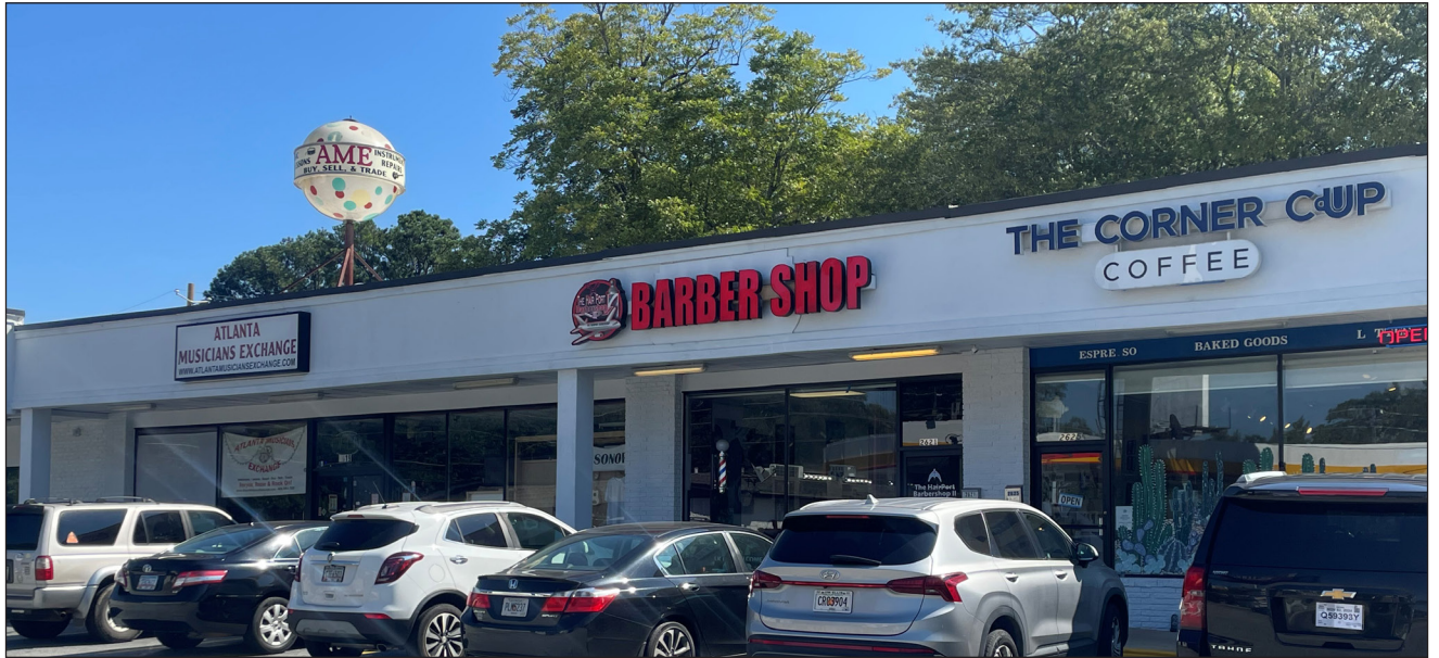
2607 Lawrenceville Highway, Decatur, GA 30033

Great Visibility - Heavy Daytime Traffic