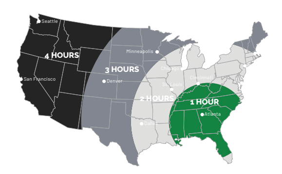
AIR TRANSIT TIMES FROM GEORGIA