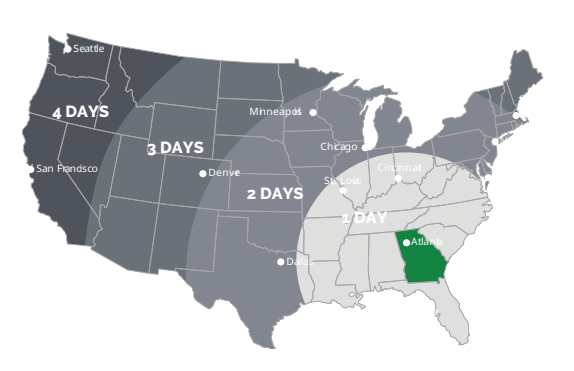
TRUCK TRANSIT TIMES FROM GEORGIA