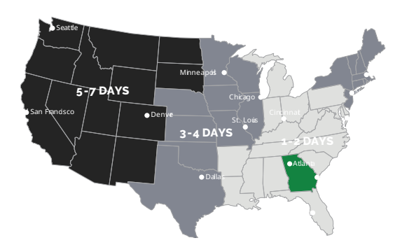
RAIL TRANSIT TIMES FROM GEORGIA