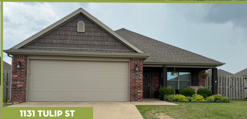
1131 TULIP ST