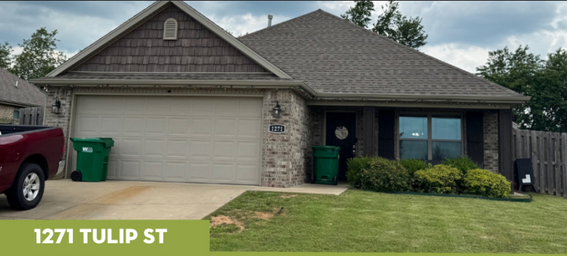
1271 TULIP ST