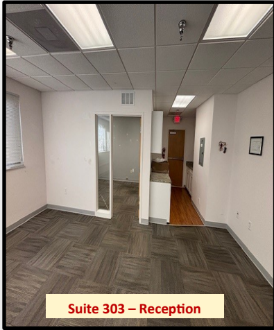
Suite 303 – Reception