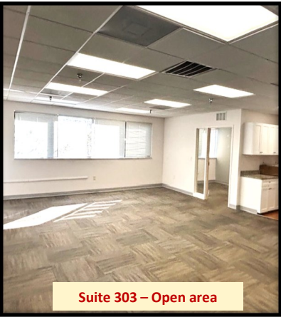
Suite 303 – Open area