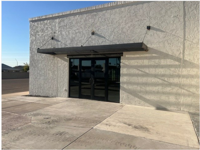
Retail Building Ste 101 - 105 Exhibit

447 S Old Litchfield Rd, Litchfield Park, AZ 85340