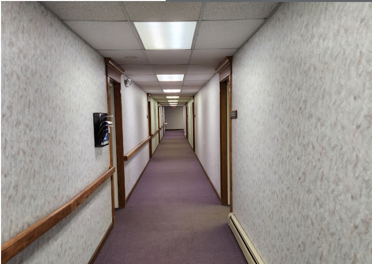
LOWER LEVEL HALL