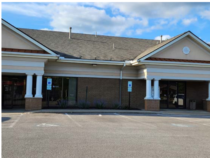
DEDICATED PARKING SPACES