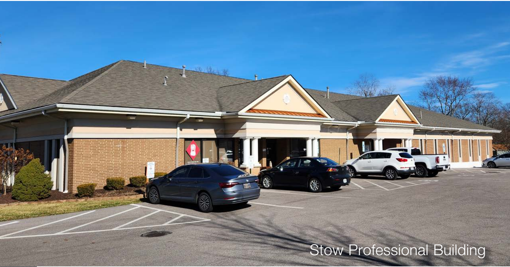
Stow Professional Building