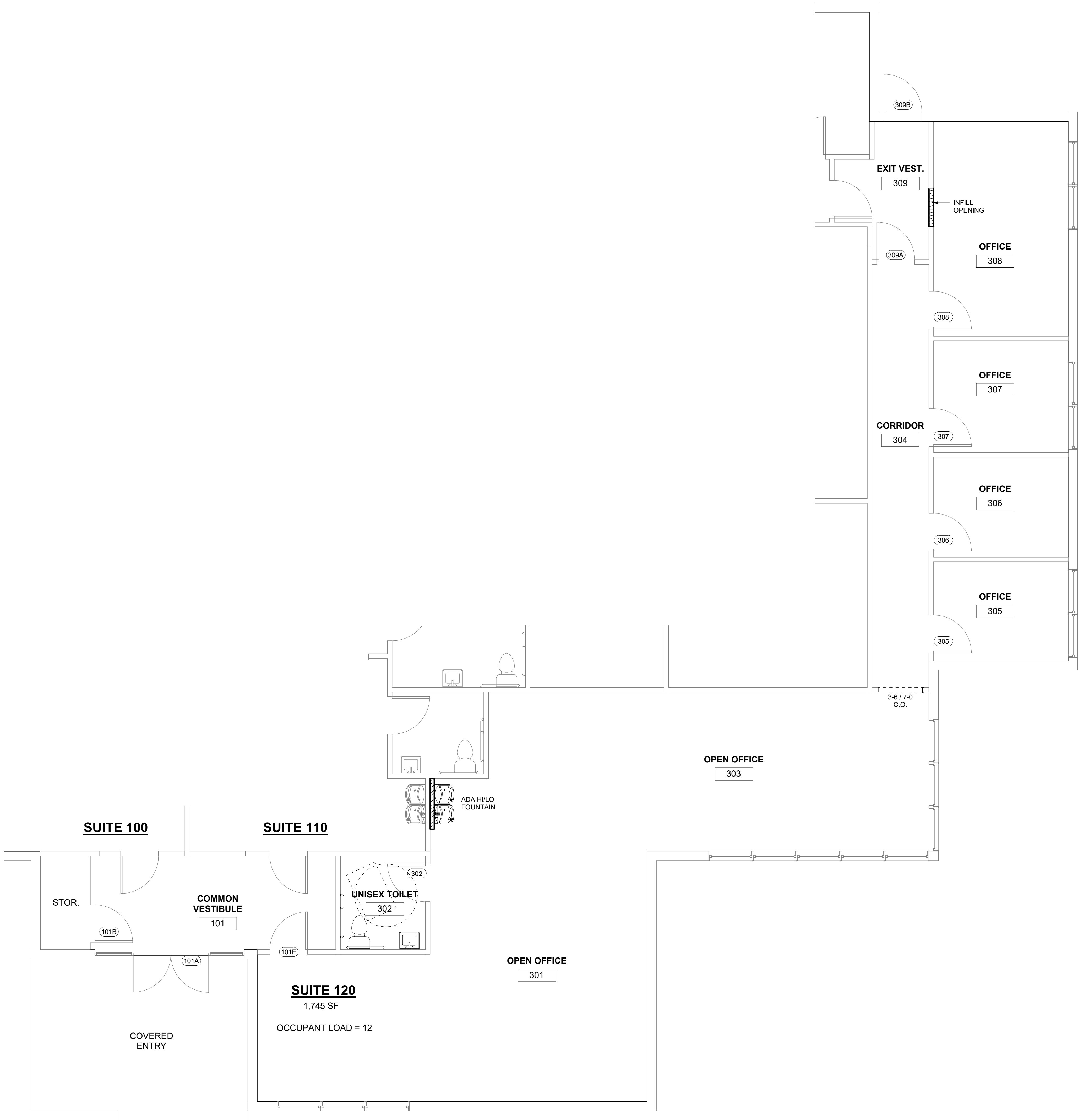
1 FLOOR PLAN - SUITE 120 A101 1/4" = 1'-0"