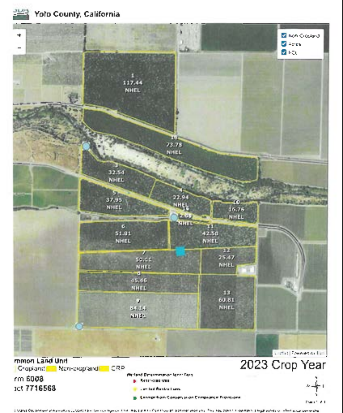
VARIETAL PLANTING MAP