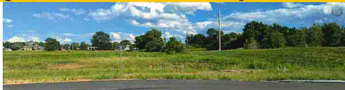
MOLLY PITCHER HIGHWAY

Level to gently rolling topography. Public utilities: water, sewer, electric, gas, cable, and phone. Stormwater management facility installed for Lot 3 and Conrad Court FEMA Zone X not in a floodplain.