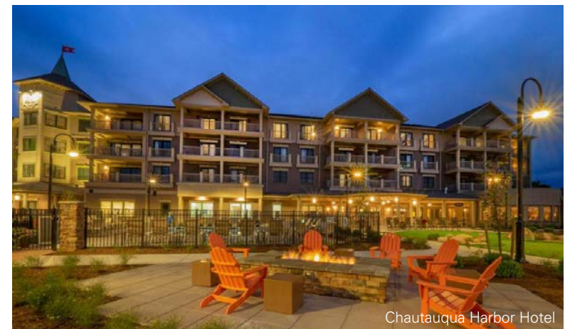
Chautauqua Harbor Hotel