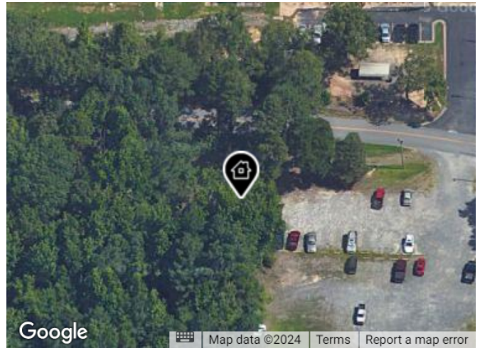
Legend: Subject Property