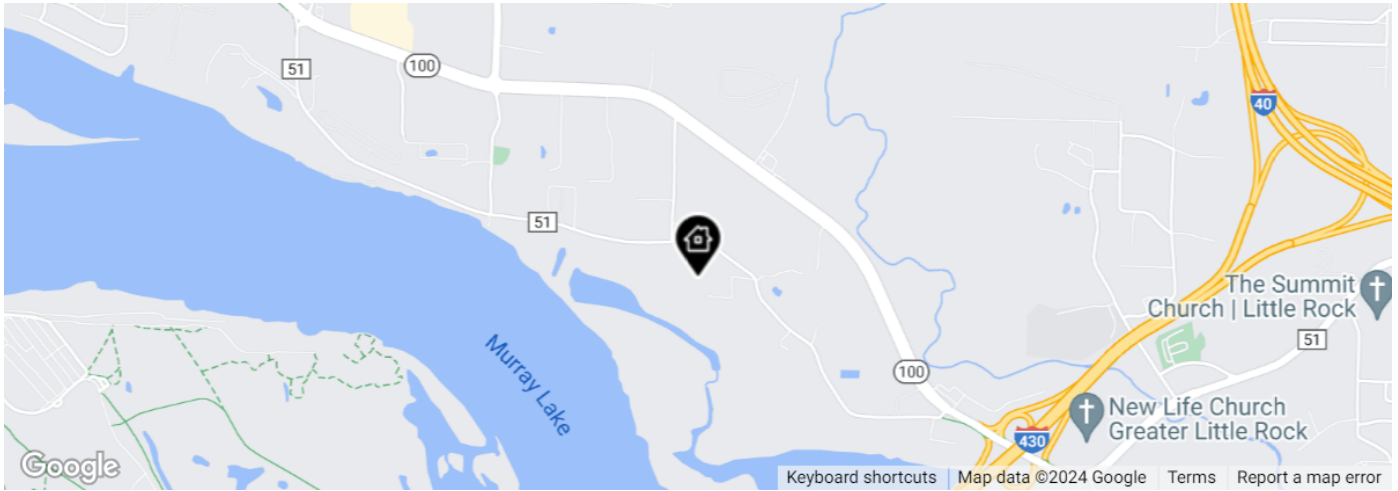
Legend: Subject Property