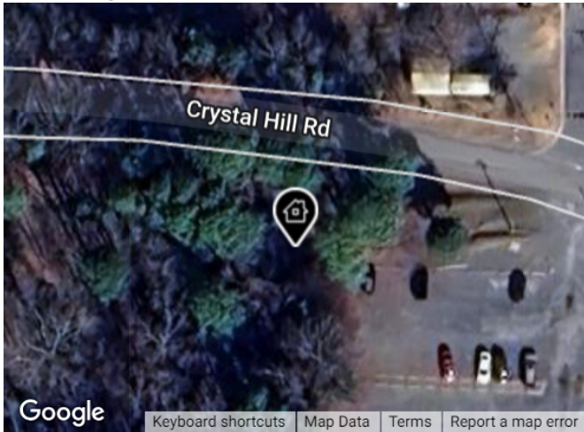
Legend: Subject Property