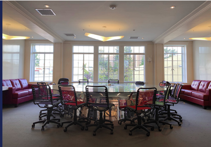
◀ Large Conference Rooms