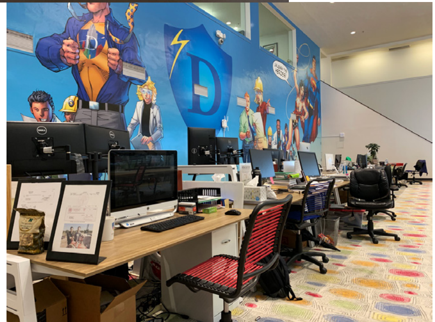
Single Desk ▶