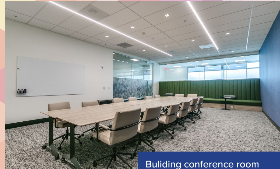
Building conference room