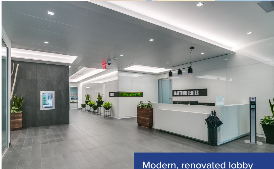
Modern, renovated lobby