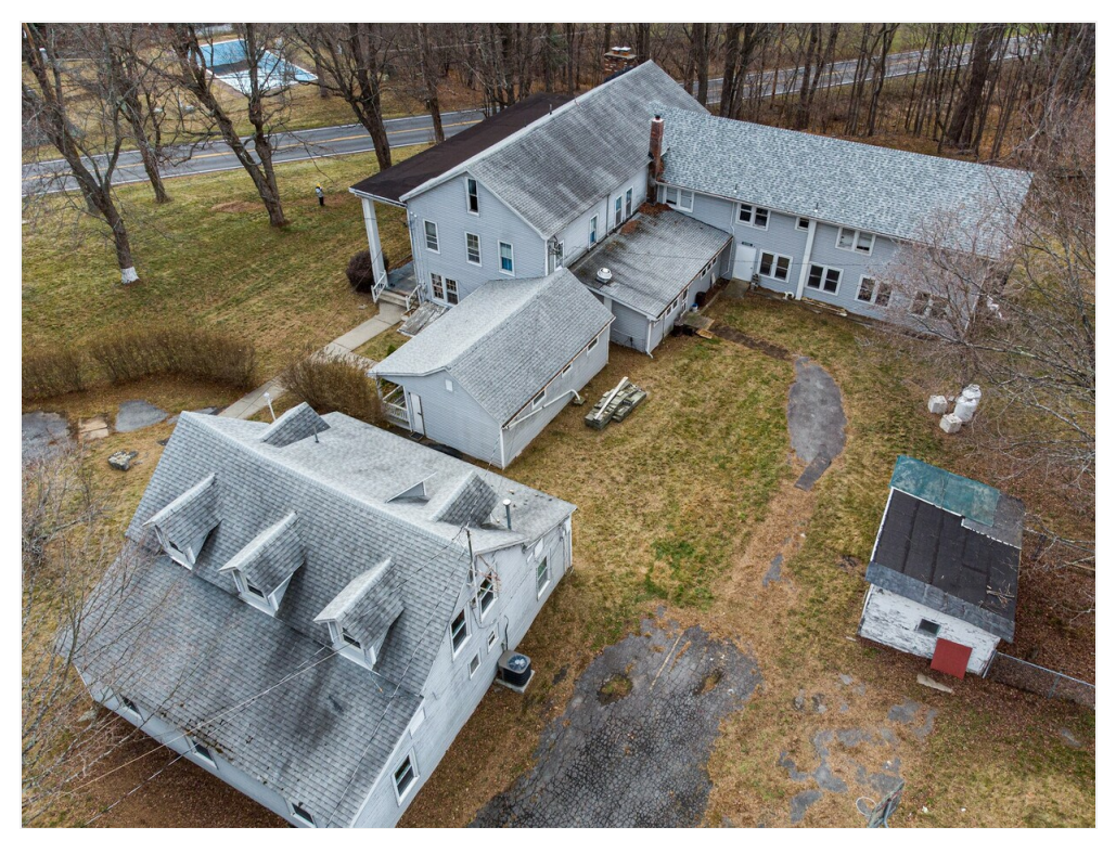
Aerial North side and road