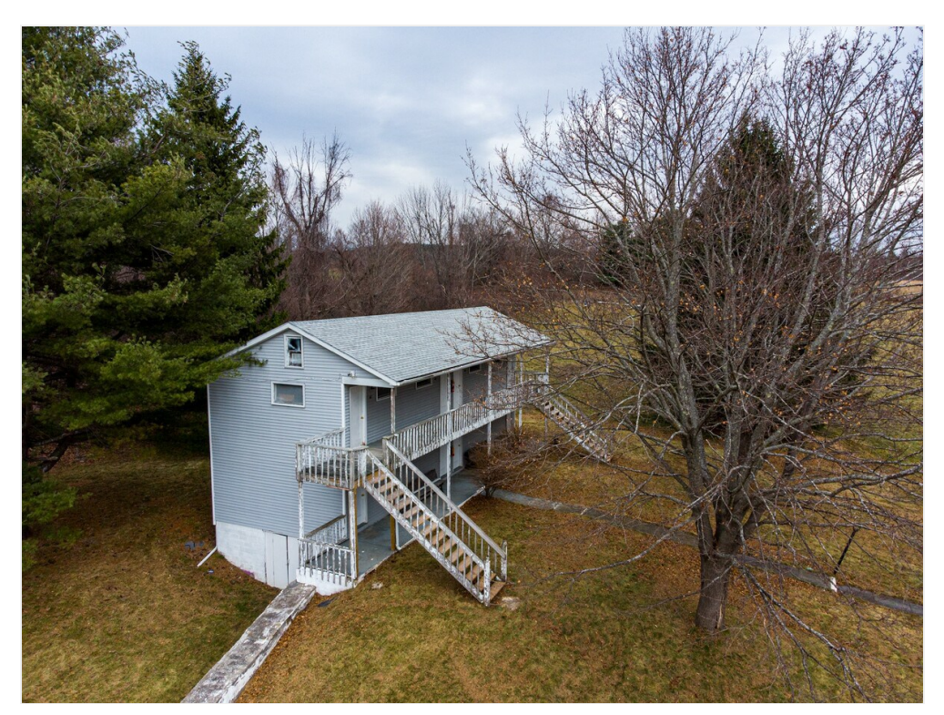
Albany 2 Two story Motel