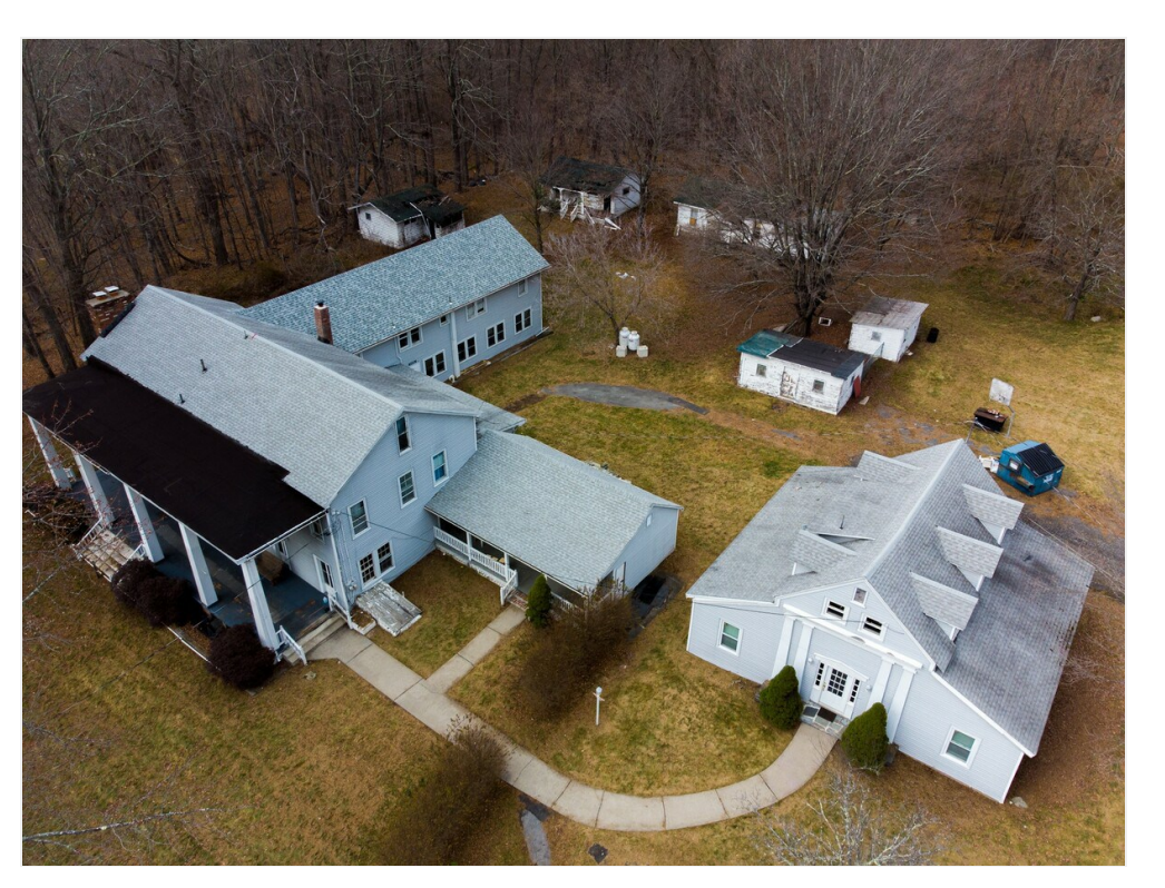
Aerial North & South Aerial main buildings front