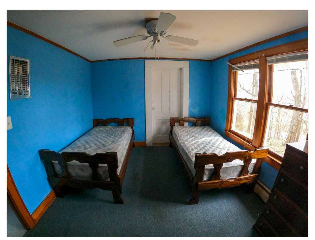
Bedroom 2 Bedroom 1