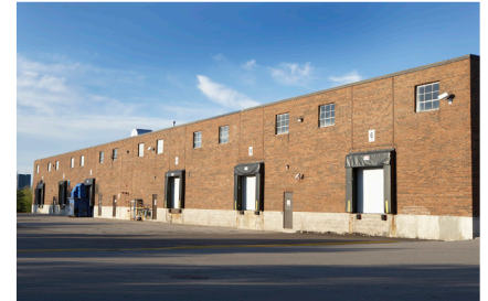
Rear Exterior Loading Area