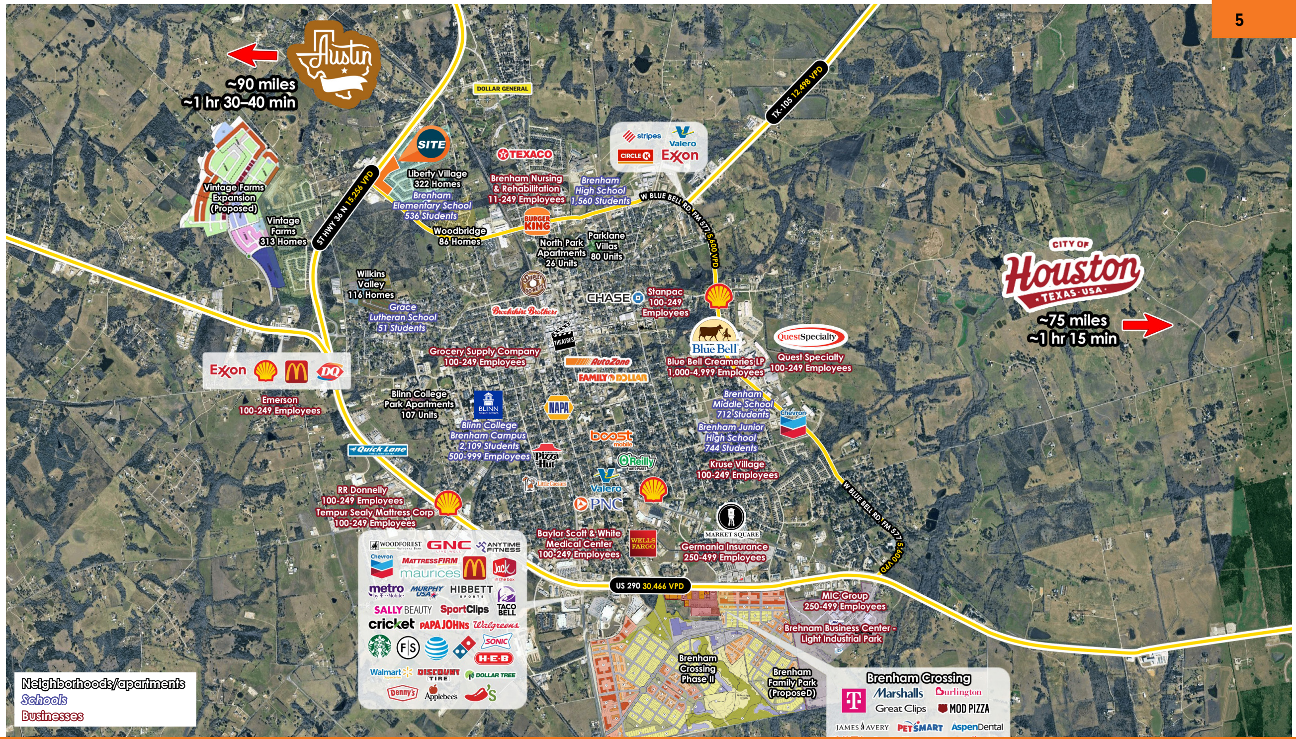
Shops at Blue Bell | NEC State Hwy 36 and FM 577 (Blue Bell Road), Brenham, Texas 77833