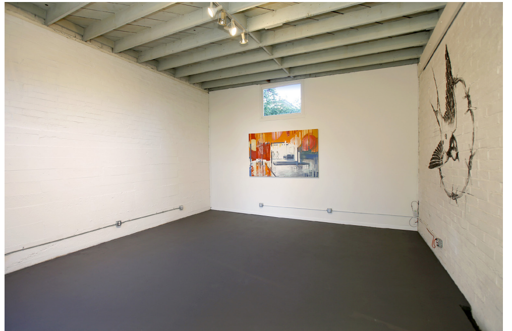
2944-2946 MACARTHUR BOULEVARD | OAKLAND